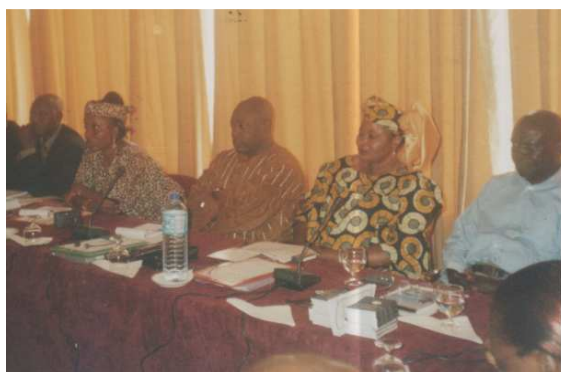
Heads of Organisations at the first meeting with OSIWA

Through these series of fundings by OSIWA, the Civil Society in the South West Province is being strengthened financially to empower the population with skills, knowledge and equipment that will enable them improve on their lives.