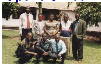
Board Members of GNGG Zambia